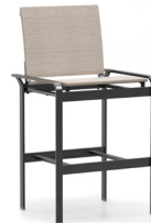
ARMLESS BAR STOOL S 56450 H: 44.5" W: 25" D: 21" Seat Ht: 30" Arm Ht: N/A