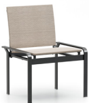
ARMLESS DINING CHAIR S 56350 S 56350-2 (2 Pack*) H: 32.5" W: 25" D: 21" Seat Ht: 18" Arm Ht: N/A (Stackable: 4-6)

The Elevate sling collection shows that elegance and strength can go hand in hand. Elevate features defined lines with added weight for resistance against strong winds. Created from custom, solid aluminum, these pieces offer tremendous resistance to wind, salt, sun, and snow. All these features combine to make Elevate sling ideal for hospitality, workplace, rooftop, and balcony environments.