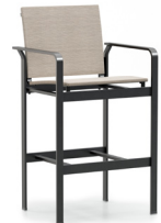
BAR STOOL S 56470 H: 44.5" W: 25" D: 21" Seat Ht: 30" Arm Ht: 36"