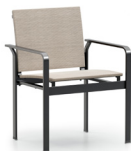
DINING CHAIR S 56370 S 56370-2 (2 Pack*) H: 32.5" W: 25" D: 21" Seat Ht: 18" Arm Ht: 24" (Stackable: 4-6)