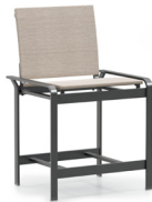
ARMLESS BALCONY STOOL S 56550 H: 38.5" W: 25" D: 21" Seat Ht: 24" Arm Ht: N/A