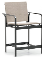
BALCONY STOOL S 56570 H: 38.5" W: 25" D: 21" Seat Ht: 24" Arm Ht: 30"