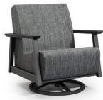
SWIVEL CHAT CHAIR

H: 35" W: 33" D: 33" Seat Ht: 18" Arm Ht: 25"