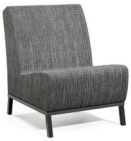
ARMLESS CHAT CHAIR

The mid-century modern era was a great time to be in furniture design. Decades later, this iconic style is experiencing a renaissance, but with all of the benefits of current technology. The Revive air collection uses our unique Sensation sling material, which offers incredible stretch, memory, and UV resistance, providing the look and feel of a cushion with none of the maintenance.