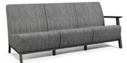
LEFT ARM SOFA

H: 35" W: 85.5" D: 33" Seat Ht: 18" Arm Ht: 25"