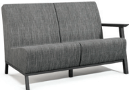
LEFT ARM LOVESEAT

H: 35" W: 59.5" D: 33" Seat Ht: 18" Arm Ht: 25"