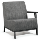
LEFT ARM CHAT CHAIR

H: 35" W: 33" D: 32.5" Seat Ht: 18" Arm Ht: 25"