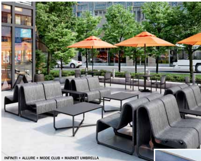
INFINITI + ALLURE + MODE CLUB + MARKET UMBRELLA