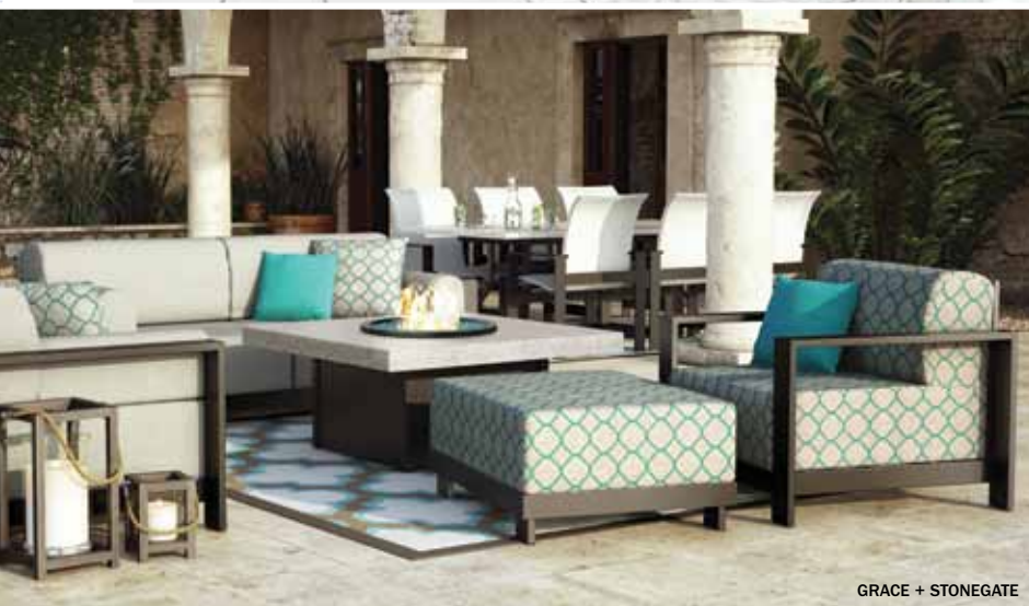
GRACE + STONEGATE