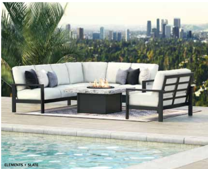
ELEMENTS + SLATE