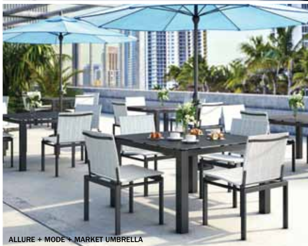
ALLURE + MODE + MARKET UMBRELLA