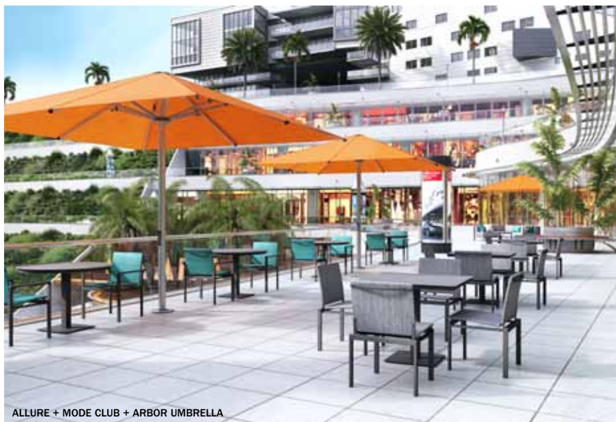
ALLURE + MODE CLUB + ARBOR UMBRELLA