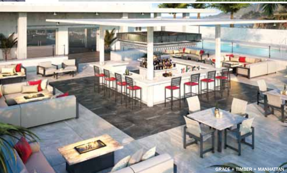
GRACE + TIMBER + MANHATTAN