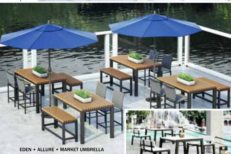
EDEN + ALLURE + MARKET UMBRELLA