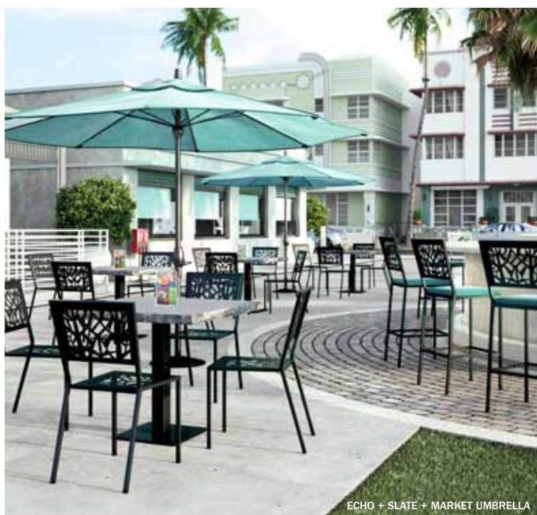
ECHO + SLATE + MARKET UMBRELLA