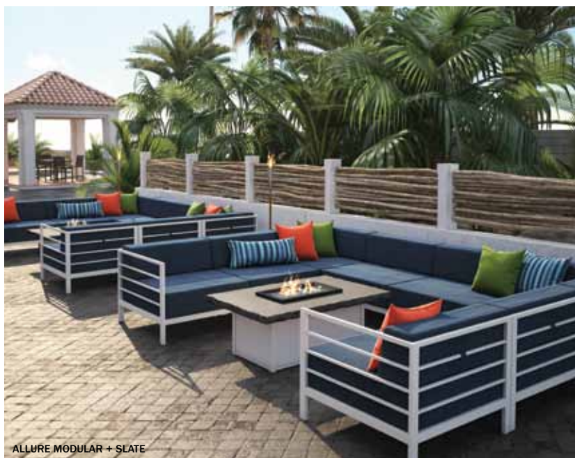
ALLURE MODULAR + SLATE