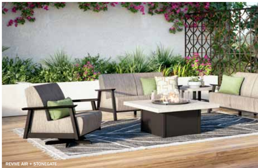
REVIVE AIR + STONEGATE