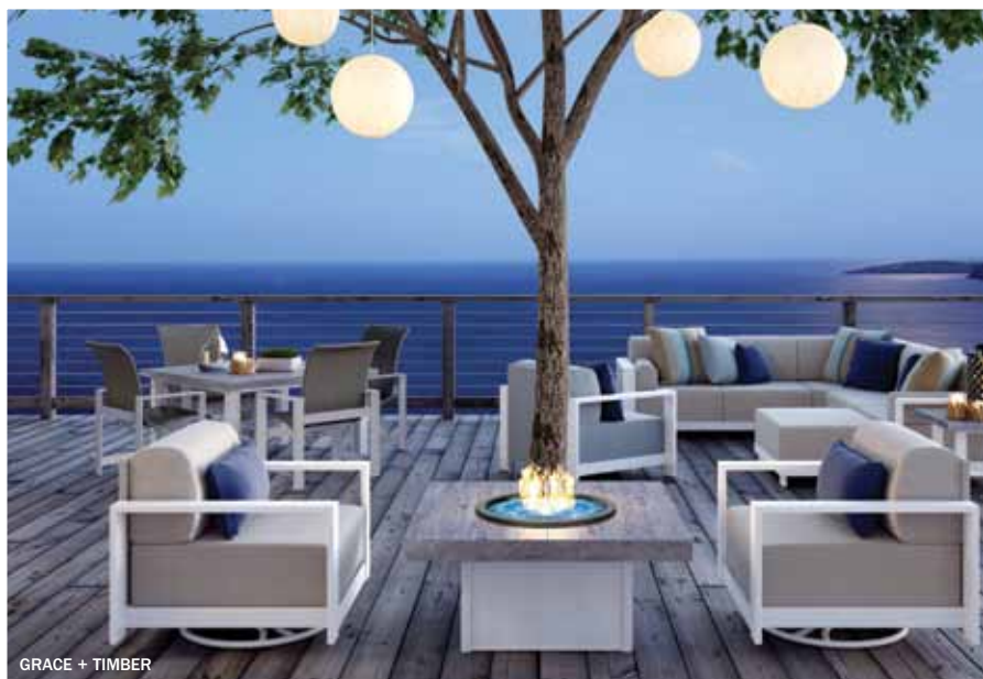
GRACE + TIMBER