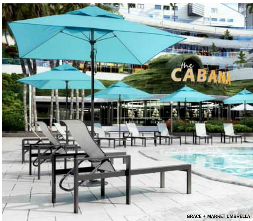
GRACE + MARKET UMBRELLA