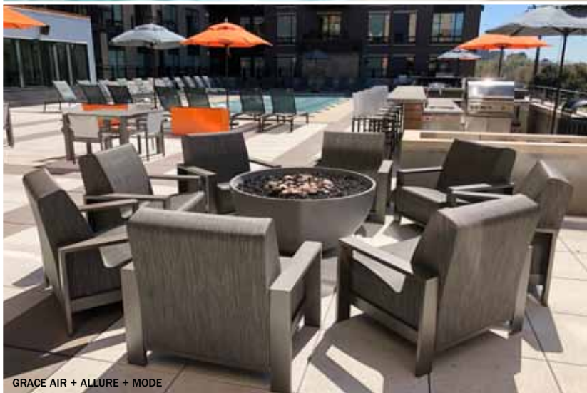
GRACE AIR + ALLURE + MODE