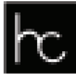
▲ Low resolution designs will require a redraw for legibility and application purposes.