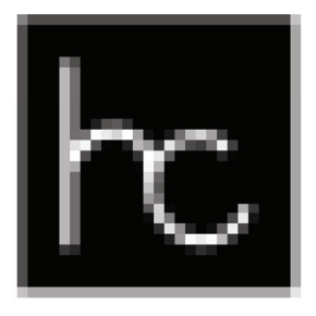
▲ Low resolution designs will require a redraw for legibility and application purposes.